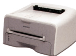
ScanPro 200z Shown with MCC100 Combination Carrier