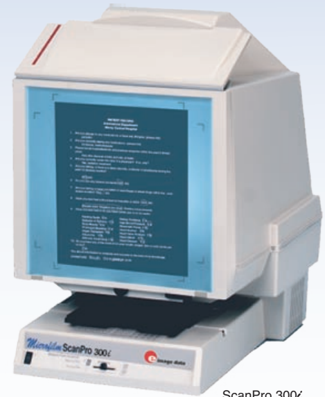
ScanPro 300z Shown with Fiche Carrier