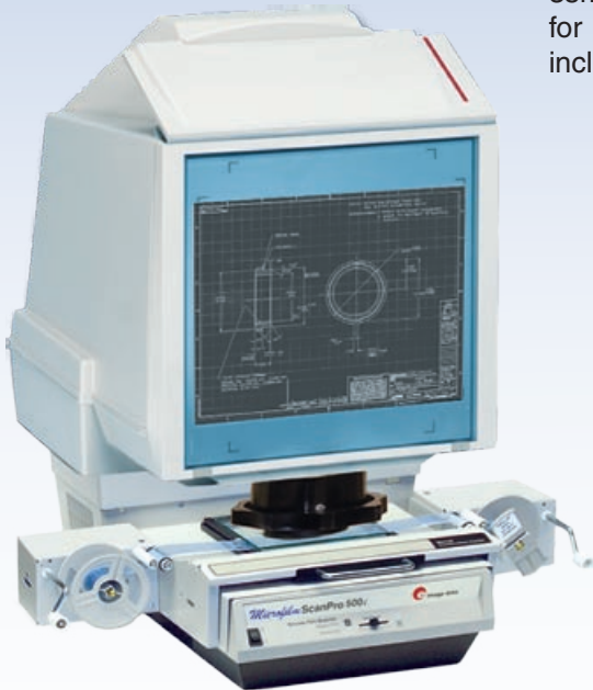
ScanPro 500 z with MCC100 combination carrier

Affordable solution for newspapers and engineering size documents stored on microfilm. The ScanPro 500 z utilizes precision, high resolution lenses making it possible to easily view and scan full size aperture card and newspaper images on 35mm film in a single scan. The scans can be enlarged on the computer monitor for detailed viewing and for printing to large format paper. And, using the included software you can e-mail, network, and print right from your PC.